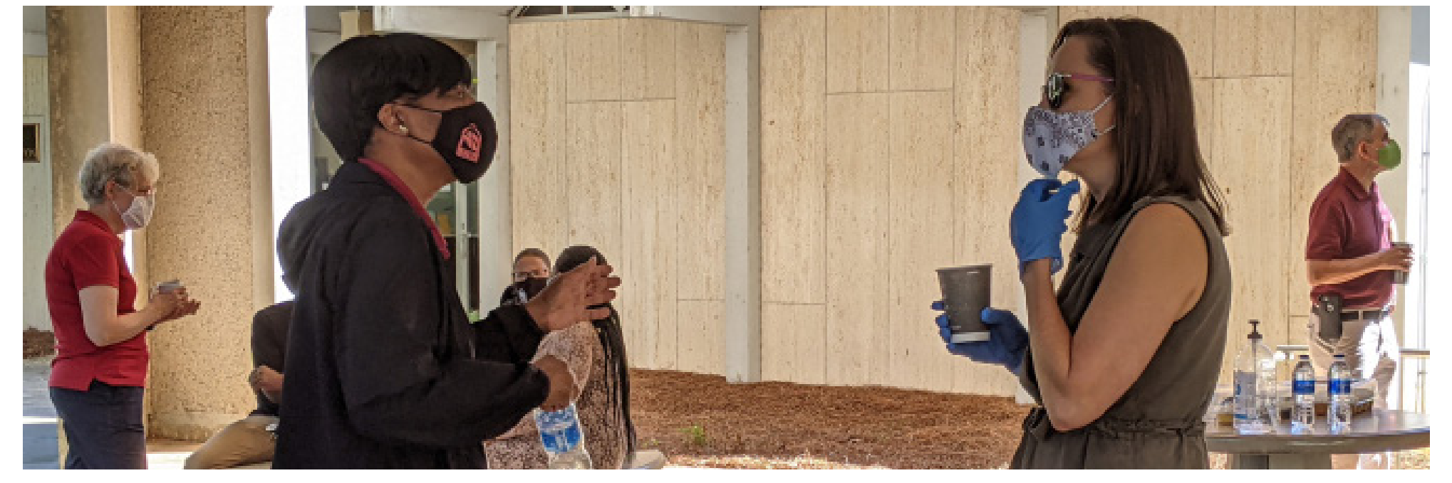
Lutheran Theological Southern Seminary is adapting its student learning outcomes in order to better prepare candidates for ministry.