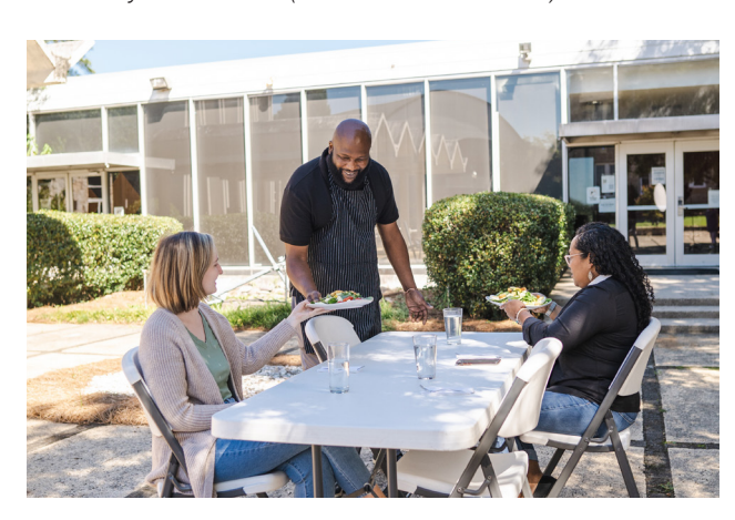
The garden-to-table initiative offers vegetarian and vegan meal options such as fried eggplant filet and baba ghanoush. (Photo credit: Charles Uko)

Alexander formed Axiom Farms to address food insecurities through his restaurant Rare Variety Café while providing fresh produce to the community via food hubs. (Photo credit: Charles Uko)