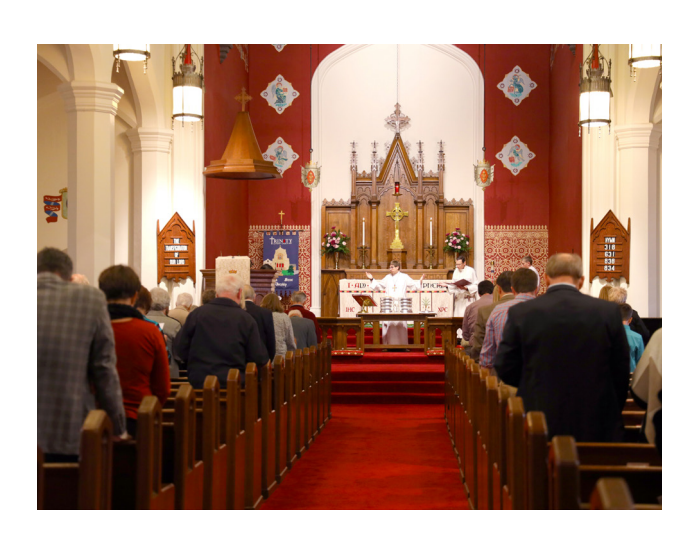
Prior to COVID-19, seminarians such as Luke Delasin were preaching in front of full congregations.